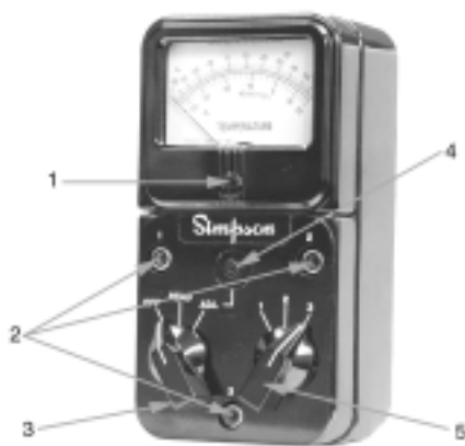
Figure 3-1. Panel Front

The following paragraphs will describe, with the aid of Figure 3-1, the principal controls of the 385-3L.