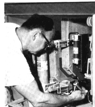
Figure 2 Contact Tip Replacement

Brush all dirt or dust from the contactor. Pay particular attention to the stationary and movable contact surfaces. Discoloration of the surfaces and slight pitting is allowable. If the contact surfaces show burned marks, grooves, deep pits, or are structurally weakened, they should be replaced.