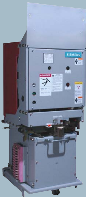
5-HVR (Replacement for ITE HV)