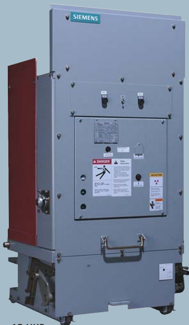
15-HKR (Replacement for ITE HK)