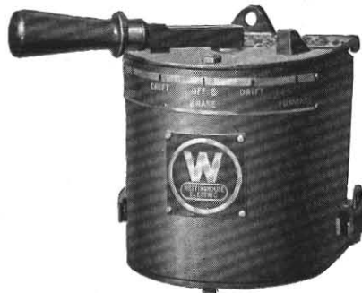
Fig. 1—Type N-300 Drum Switch (Formerly Type 810)

The contact finger should be adjusted so that it drops from \frac{1}{16} " to \frac{1}{8} " below