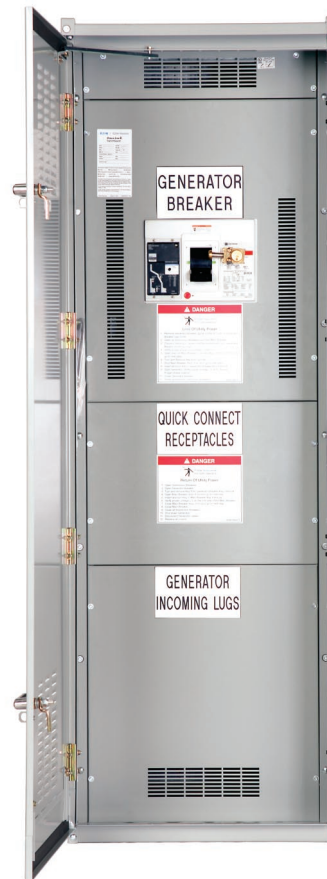
Typical Generator — Quick Connect Assembly (External View)

You cannot predict the future... but with Eaton's Generator Quick Connect Switchboard you can be prepared for the unexpected.