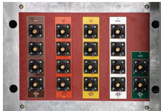
Cam Lock Receptacles with Color Coded Generator Connections

strikes, or other natural disasters, Eaton has a quick and easy solution for you. In conjunction with having a portable power supplier to provide a mobile, trailer-mounted generator delivered to your site, Eaton's Generator Quick Connect Switchboard is the answer to getting your facility back on line quickly.