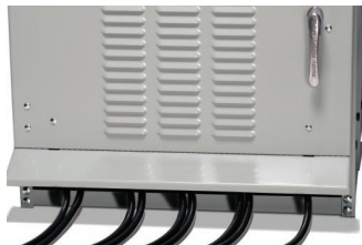
Bottom Flip Up Cover for Easy Access to Incoming Lugs or Cam Lock Receptacles